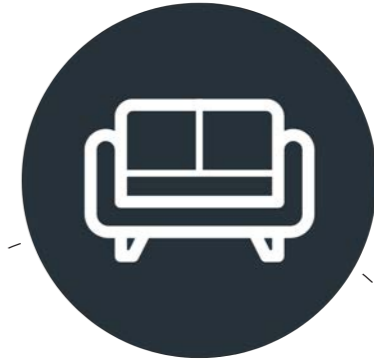
INSTALL, STAGING & WASTE DISPOSAL