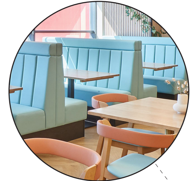
STYLING & PHOTOGRAPHY