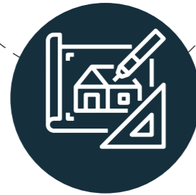
SITE VISIT & PLANNING